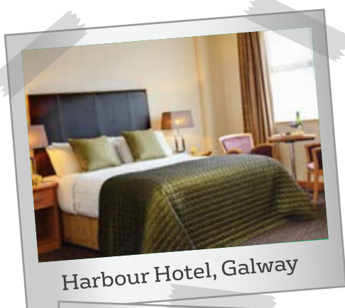
Harbour Hotel, Galway