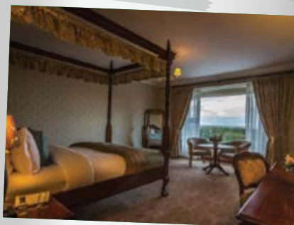
Glenlo Abbey, Galway